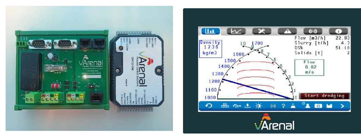
Dredging analyzer, to be mounted on DIN Rail